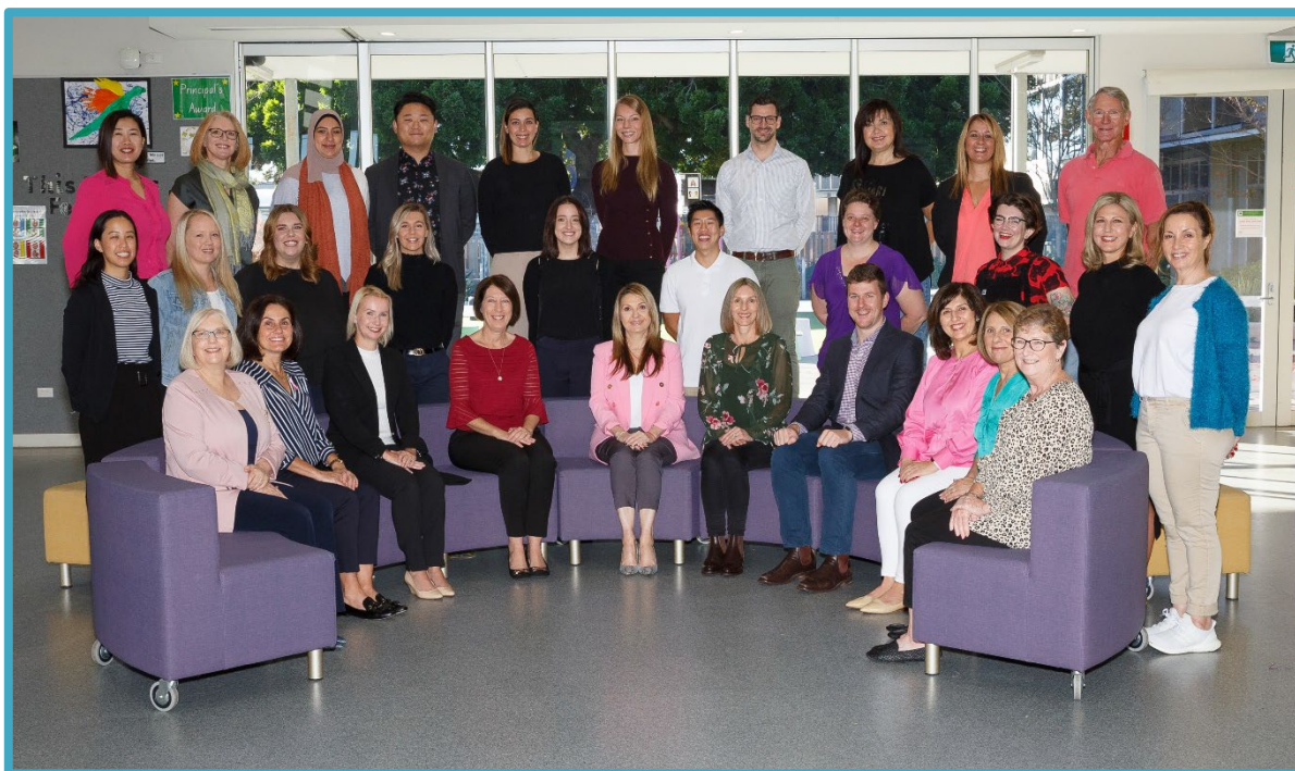
Lucas Gardens School Staff