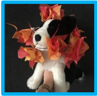
P1 honours our toy dog with a floral garland for Tihar

The next thing to investigate was the world of Nepalese pottery! Local craftsman in Nepal use clay to make items such as bowls, spoons, and plates. As a result of our research, we decided to 'get our hands dirty' and take part in this tradition.