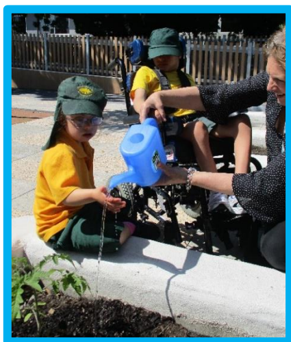
Students watering the new plants