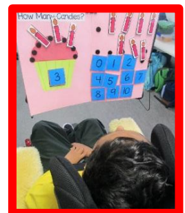
Daniel and Isaac practising their number skills

The students are enjoying participating in outdoor sporting activities. We are working 'one on one' across a variety of sports to practise catching and throwing activities, working on the students arm movements and their participation with each other.