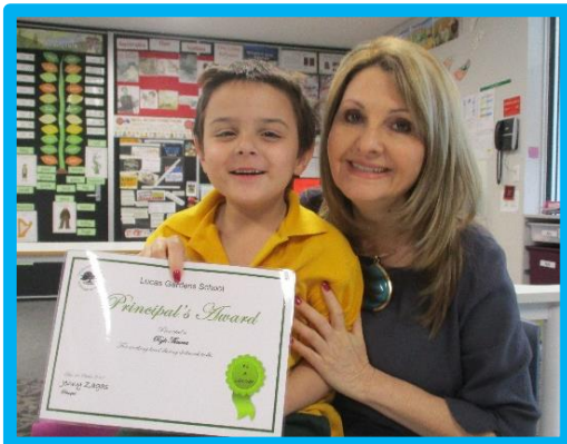
Ryle for 'Working hard during deskwork activities'