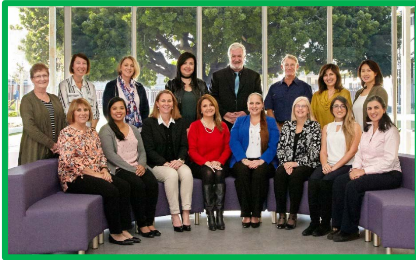
Lucas Gardens School Staff